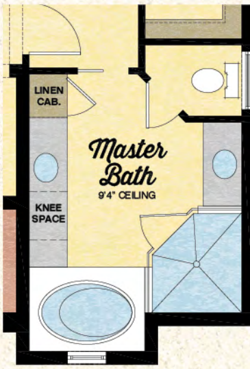
Available Master Bath Variation